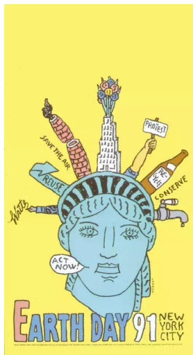
Figure 2. Earth Day in New York

Earth Day in New York is more than just a poster, it's more of a powerful environmental manifesto. In Chwast's writing, the Goddess of Liberty is no longer a simple symbol, but a messenger of environmental protection, calling on people to pay common attention to environmental issues. This concept of environmental protection across national boundaries and beyond races makes this work have a broader social influence and historical significance. This representative work not only shows the designer's outstanding talent and unique artistic style, but also reflects his sense of responsibility and mission as a social citizen.