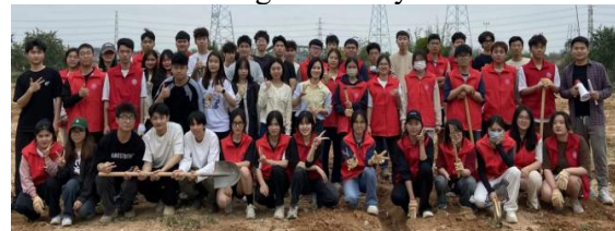
Figure 1. "Art Open Dig" Activity of School of Art and Design, Guangdong University of Science and Technology

Guide students and clothing teachers to dig deeper and refine the education elements contained in each course, and give play to the educational function of "curriculum theory". [2] For example figure 1: "Art Open Dig" activity of School of Art and Design, Guangdong University of Science and Technology, "Yi Qi Slit", "Yi Qi cut" and "Yi Qi drawing" make full use of network resources to promote the main theme and spread positive energy to achieve full coverage of theory.